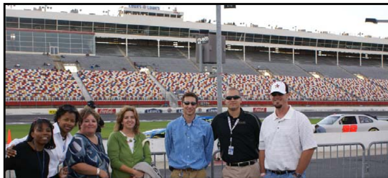
Dream Builders Communication, Inc. and Fredell-Statesville Educators Tours the Lowe's Motor Speedway Drivers! Start Your Engines!!