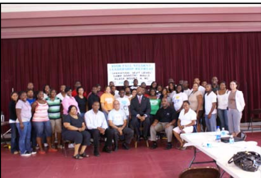
Pictured above: Dream Builders Communication, Inc. Inspires the Livingstone College Student Government Association (SGA)